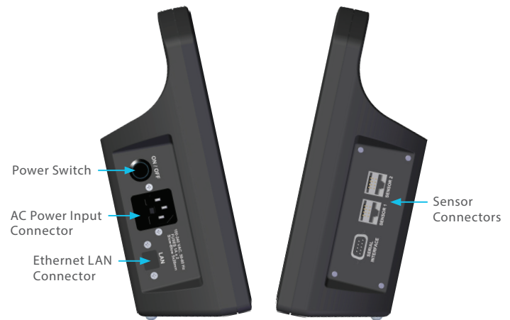
MODEL 4421A Side Views

The 4421A is the next generation replacement for the industry standard Model 4421. Building upon the original model's high level of accuracy and its ease of use, the new 4421A enhances the meter's functionality by utilizing a smaller/lighter design, by providing the ability to have dual sensor inputs and by displaying time plots of the power measurements.